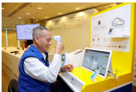
Elderly measured health data at eHealth station at elderly centre

Website: http://www.jc-ehealth.hk/en/index.html