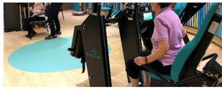
Elderly enjoy using health devices at elderly centre under the instruction of staff