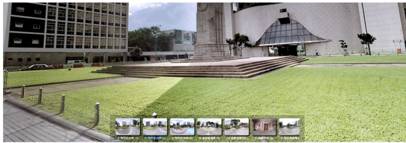
Visiting The Cenotaph via VR tour.